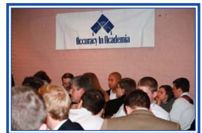
Crowd at author's night