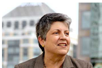
Northeastern University — University of California President Janet Napolitano