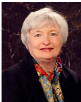
New York University — Federal Reserve Chair Janet Yellin