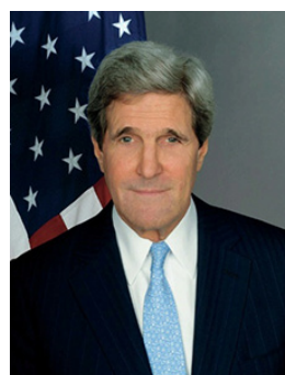
Yale University — Secretary of State John Kerry