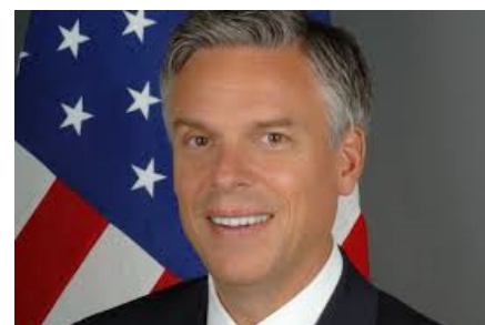
University of Wisconsin — Former Utah Governor Jon Huntsman