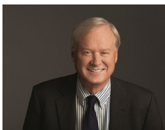
Princeton University — Former Vice President Al Gore