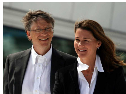
Smith College — International Monetary Fund Managing Director Christine Lagarde