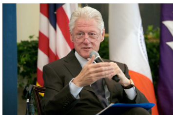
New York University Abu Dhabi — Former President Bill Clinton